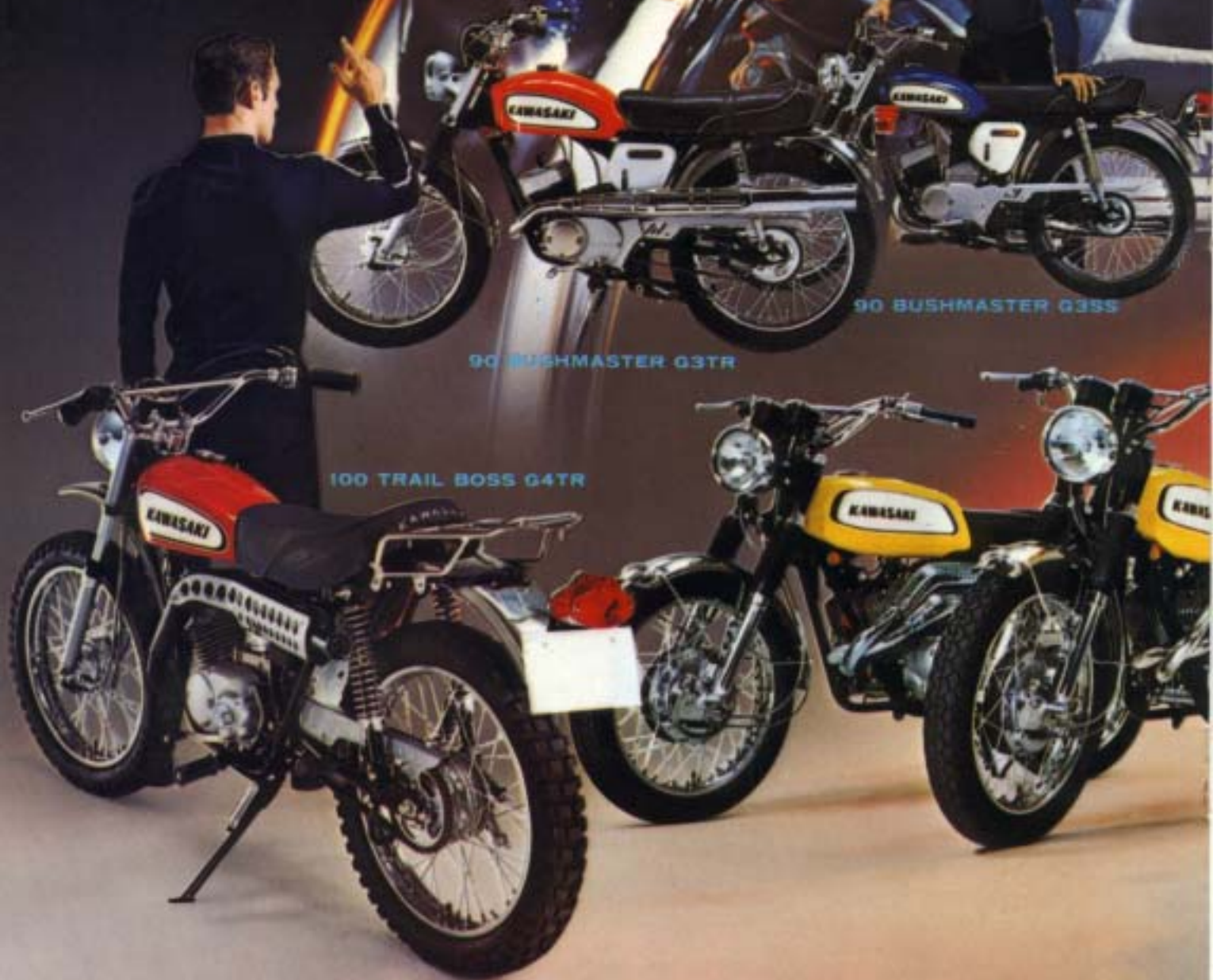
90 BUSHMASTER G3SS